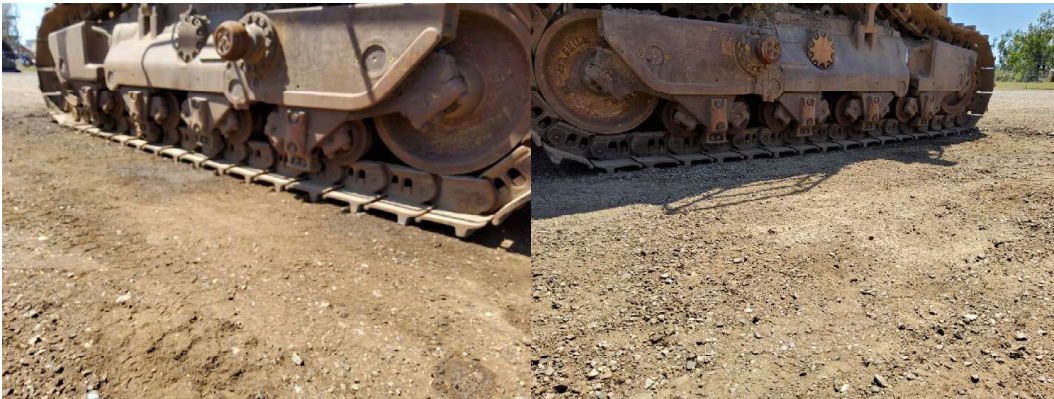
Left Track Roller 1