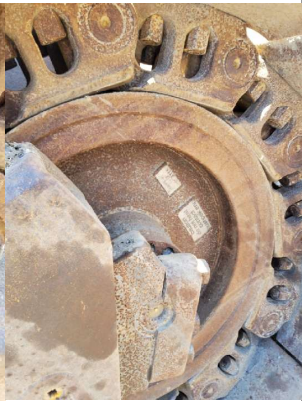
Right Idler 1