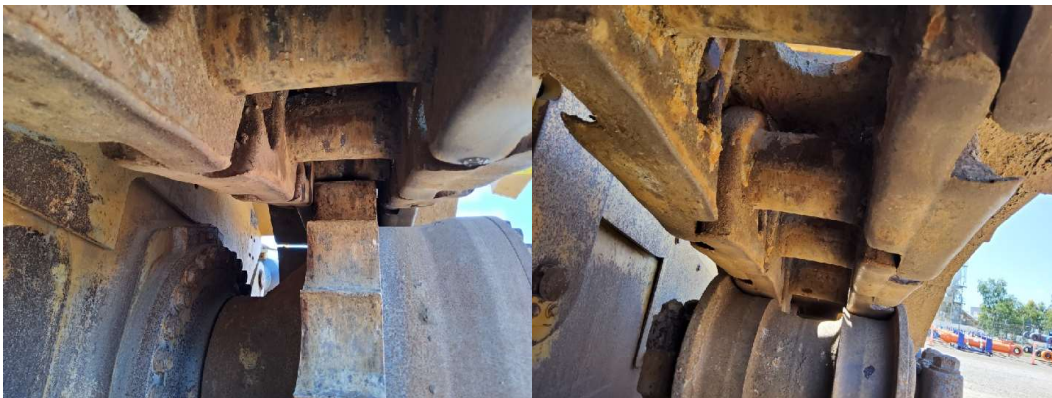
Left Track Link 1