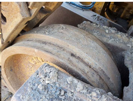
Right Idler 2