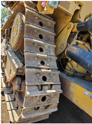
Left Track Shoe 1