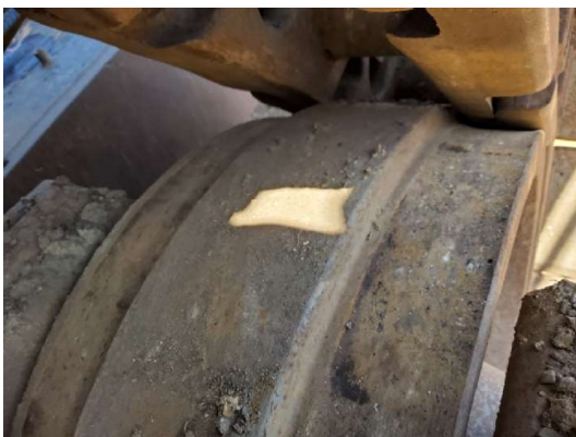
Left Idler 2