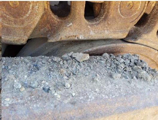
Right Idler 1