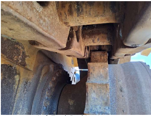
Left Track Bushing 1