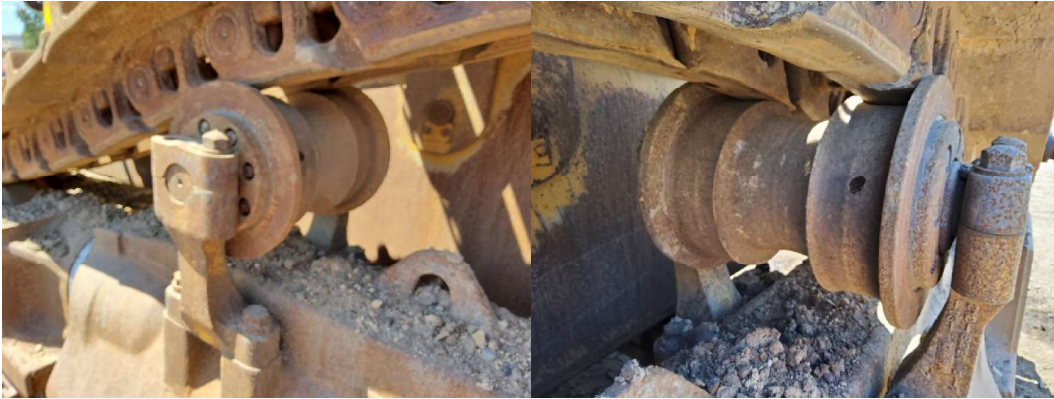
Left Carrier Roller 1