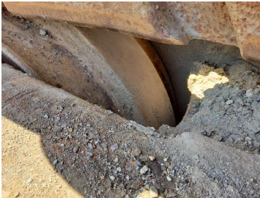
Left Idler 1