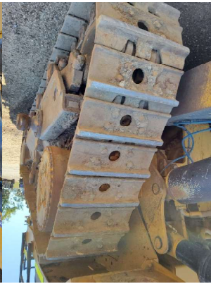
Right Track Shoe 1